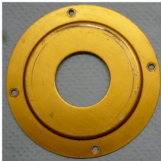
Heat shield outside

measured the thickness of the drag plate.... varies between 1.41mm and 1.82mm Have to talk to a mechanic if he can grind the plate flat.