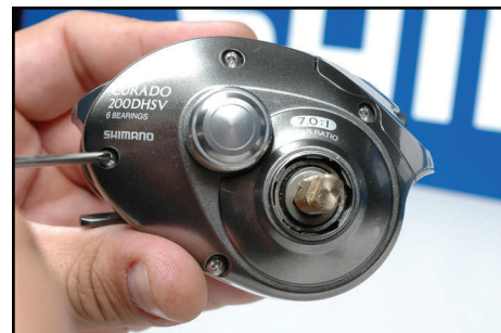
The sideplate will be removable after the sideplate screws are removed.