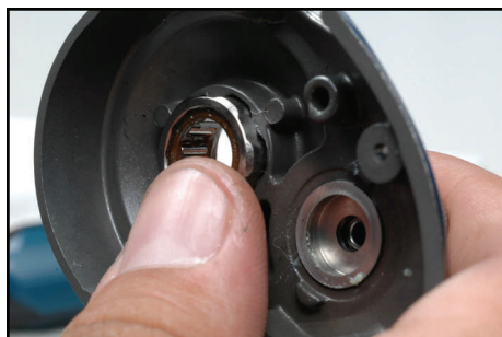
With the old roller clutch bearing out, clean off any debris, rust or excess grease. When installing the new bearing, make sure that it is installed in the correct direction, otherwise, the handle will not turn.