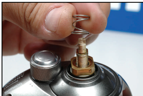
Remove star drag spring and star drag nut. Remove star drag springs and spacer underneath as well. Refer to schematics.