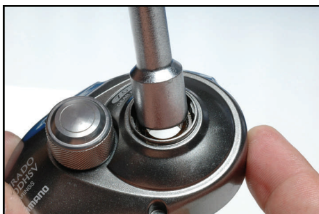
If changing anti-reverse roller clutch bearing, use a 10mm nutdriver to dislodge it from the sideplate. If only changing the drag, skip this step as well as the next two steps.