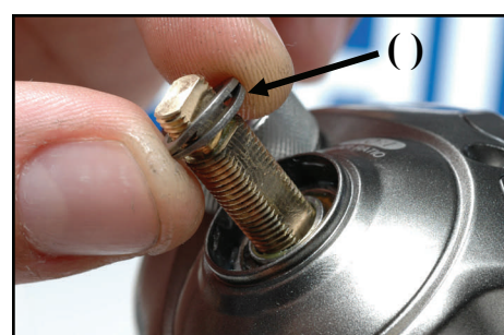
Important: After re-installing the sideplate, re-install the drag star springs as depicted above- (O). If they are not installed correctly, the drag range will be affected. Run the Diagnostic Procedures again to ensure proper function of the anti-reverse and/or drag.