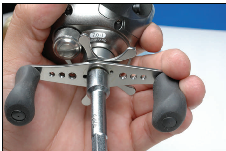
Remove handle nut plate, handle nut, handle, and star drag assembly. Note: Left hand reels feature reverse threads for the handle assembly.

Schematics: http://fish.shimano.com/publish/content/fish/sac/us/en/customer_service/reel_schematics.html