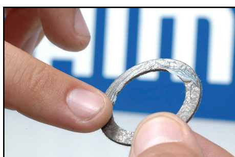
Grease Dartanium® drags with a light coat of Shimano® Drag Grease . The old style fabric drags will require more grease than Dartanium drags. More grease= smoother drag. Less grease= more drag pressure. Excessive grease will yield insufficient drag pressure.